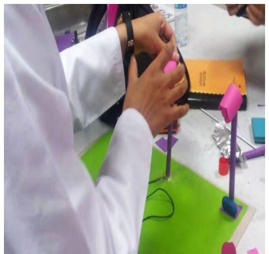
Activity 1. Lighting design that reduces light pollution