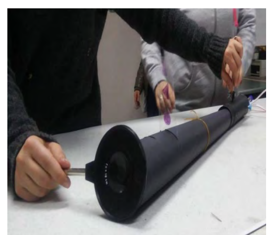
Activity 5. A design for the use of lenses