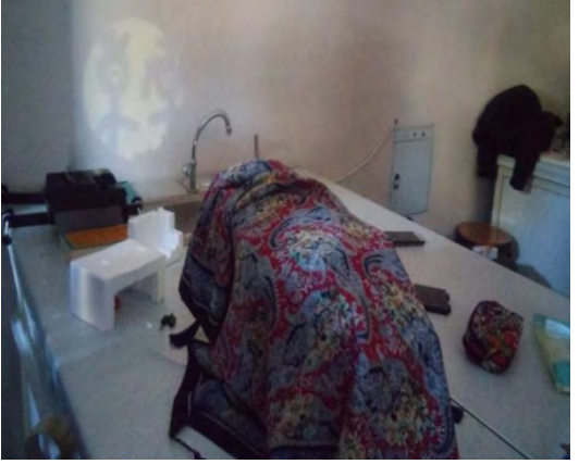
Activity 4. Projection design