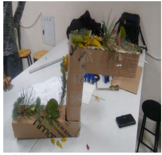
Activity 2. Periscope design