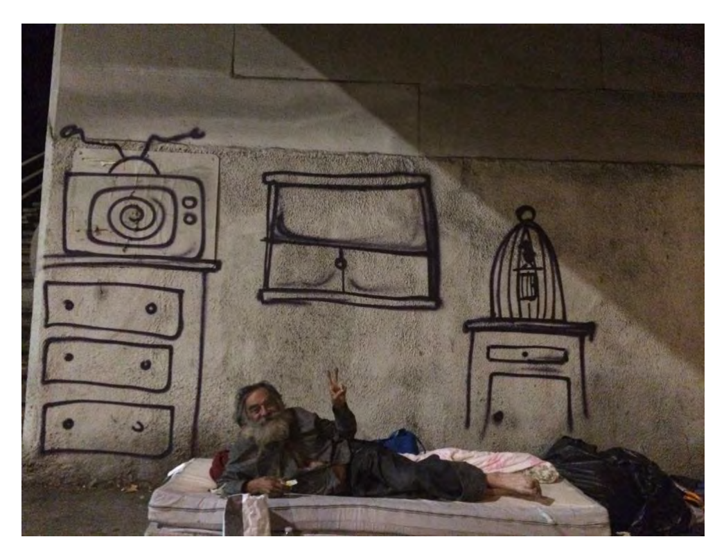
Figure 5. A Bedroom Mural for a Homeless Individual. Photography provided by Skid Robot. Used with permission. Courtesy of the artist.

Similarly, using a spray paint and sketch technique with some line work, Robot creates a bedroom feel for a homeless person (see Figure 5). The bedroom is simple yet cozy. In this mural sketch, the homeless person imaginarily has a clothes drawer with a TV on top and a birdcage housing his pet to keep him company. His bedroom has a window right above him as he is lying on his mat, smiling and greeting the viewer. Robot's simple sketch brings tremendous warmth and imaginary comfort for the person seeking to find a sense of comfort as if they had a home.