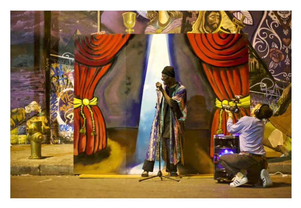
Figure 1. A Stage for Homeless Individuals to Perform.

Figure 2 features a street camping site where homeless people live. Robot painted a serene mountain scenery on the wall as a backdrop to situate homeless people's living conditions. The nightly mountain scenery is illustrated with a deep blue sky, a white crescent moon, and a blue lake filled with seemingly calming spring water. The serenity of this natural landscape offers homeless people a sense of comfort and peace, which securely housed persons take for granted (see Figure 2). Figure 3 shows a homeless person who is getting into the Christmas spirit. He is surrounding himself with a delightfully decorated Christmas tree and several colorful presents. Through the mural, Robot enables homeless people to participate, at least in some way, in the cheerful spirit of the holiday season.