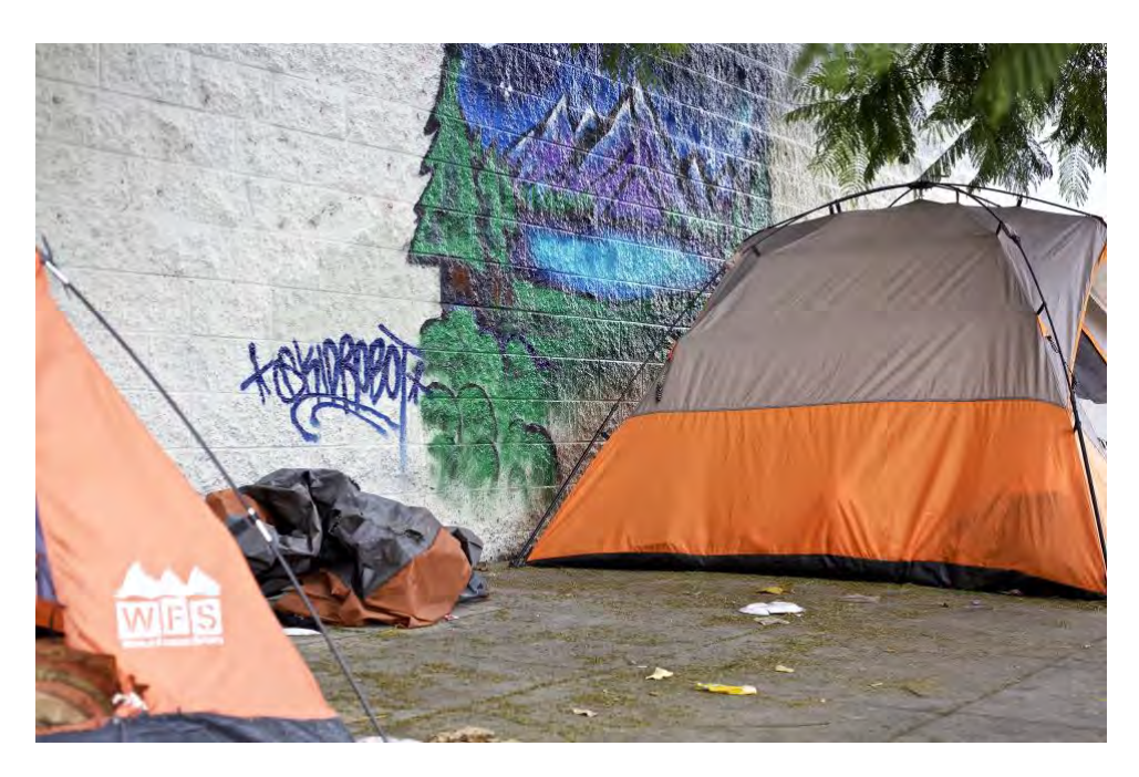
Figure 2. A Mountain Scenery for Homeless People's Camp Site.