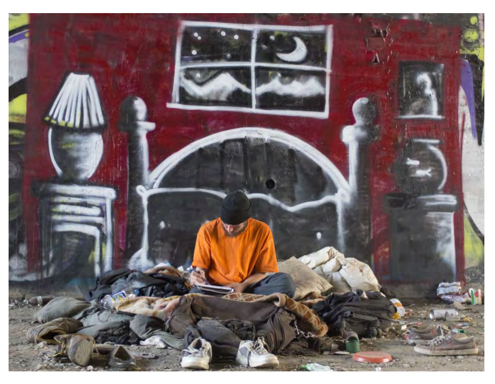
Figure 4. A King-size Bed for Homeless People.

Robot's art serves as a powerful tool to fulfill dreams and wishes of homeless people living on the streets. Figures 4 and 5 are two examples of what homeless people would need in real life. In Figure 4, a king-size bed, a bedside lamp, and a fishbowl are placed purposefully next to the bed to accentuate a home-like touch. There is a window behind the bed where viewers can clearly see stars and the moon. A painting is hung above the fishbowl in this imaginary bedroom. The warm red color also shapes the cozy atmosphere of a home. As seen, a homeless individual appears to write on his notebook, surrounded by a pile of clothes and bedroom accessories. The bedroom mural again offers the individual a sense of feeling at home.