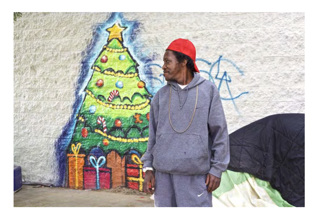
Figure 3. A Christmas's Tree and Gifts for a Homeless Individual. Photography provided by Skid Robot. Used with permission. Courtesy of the artist.