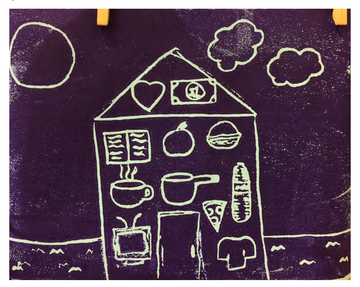
Figure 6. A Home for the Homeless People Drawn by an Elementary School Student.

society and an image of money, representing donated funds to organizations helping homeless people.